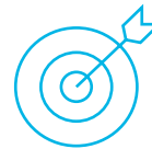
Increase Mission Effectiveness