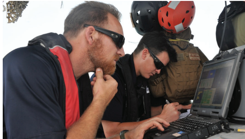
Peraton technicians assigned to Naval Information Warfare Center–Pacific conduct post-mission analysis of a Mk 18 Mod 2 unmanned underwater vehicle.

“We want to set ourselves up as the single point of contact for the government for making the different pieces of a very complex unmanned system of systems work together seamlessly,” Hagan said. “Peraton is excited to pair our real-world experience working with this precise type of system—an unmanned, auto-