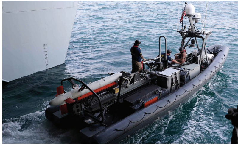
Peraton technicians assigned to Commander Fifth Fleet's mine warfare task force pilot a prototype Mine Countermeasures Unmanned Surface Vehicle out of RFA Mounts Bay's well deck during a US-UK bilateral exercise.