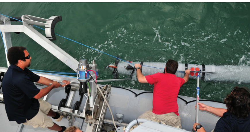
Peraton technicians assigned to Naval Information Warfare Center-Pacific conduct testing of Mk 18 Mod 2 unmanned underwater vehicle.

"We're looking at every opportunity to help the Navy identify and close capabilities gaps where autonomy is concerned," Hagan said.